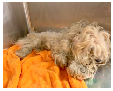
Rhett arrived to us in a group of severely neglected dogs from a hoarding case. He was so matted he could barely stand up, and was skin and bones under all that heavy, knotted, filthy fur. He's now the treasured pet of these wonderful people!