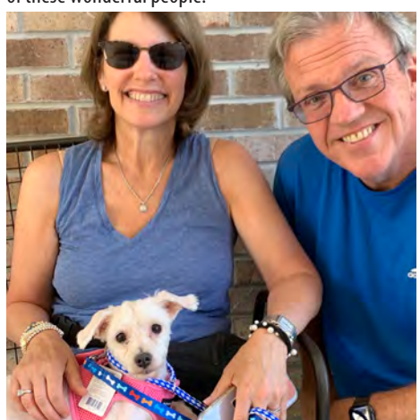
This time of year always reminds me of how generous you have been, and how much we depend on your generosity to keep our programs and services alive!

Adoptions have slowed over the last several months due to the fallout from Hurricane Ida, and this is placing an extra strain on our resources. This, along with the continued care for pets that are still displaced and have been in our shelter while owners seek new housing, has created an urgent need for more funds.