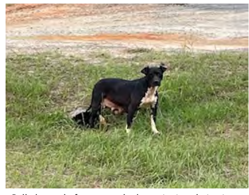
Belladonna, before rescue, had puppies in a drain pipe on the side of the road.