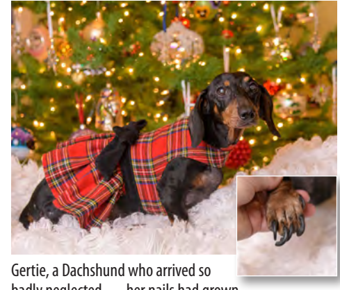
badly neglected — her nails had grown into her foot pads.