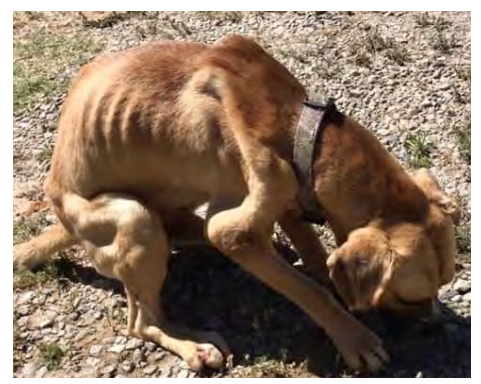
Ben, a young dog who was intentionally shot in the leg & abandoned starving, suffering and painful, now in a wonderful home where he is greatly loved.