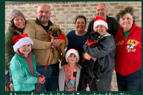
A home for the holidays! Two related families adopted 2 puppy siblings together.